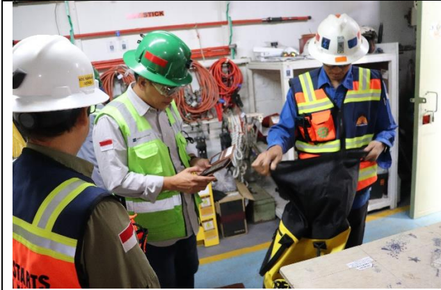
Management Inspection conducted in the Power Generator and Transmitter area of PTFI operations in the Lowlands (2/13).