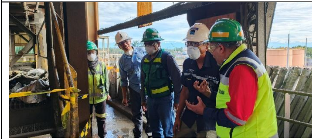
Management Inspection conducted in the Concentrate Dewatering Plant area of PTFI operations in Portsite, Lowlands (2/13).